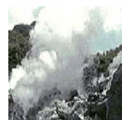
Owakudani Boiling Valley 大涌谷