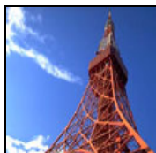
Tokyo Tower 东京塔