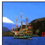
Lake Ashi Pirate Boat Cruise 海盗船游芦芝湖