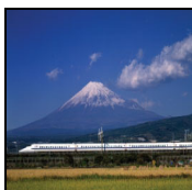
Mt. Fuji & Bullet Train 富士山 & 子弹火车